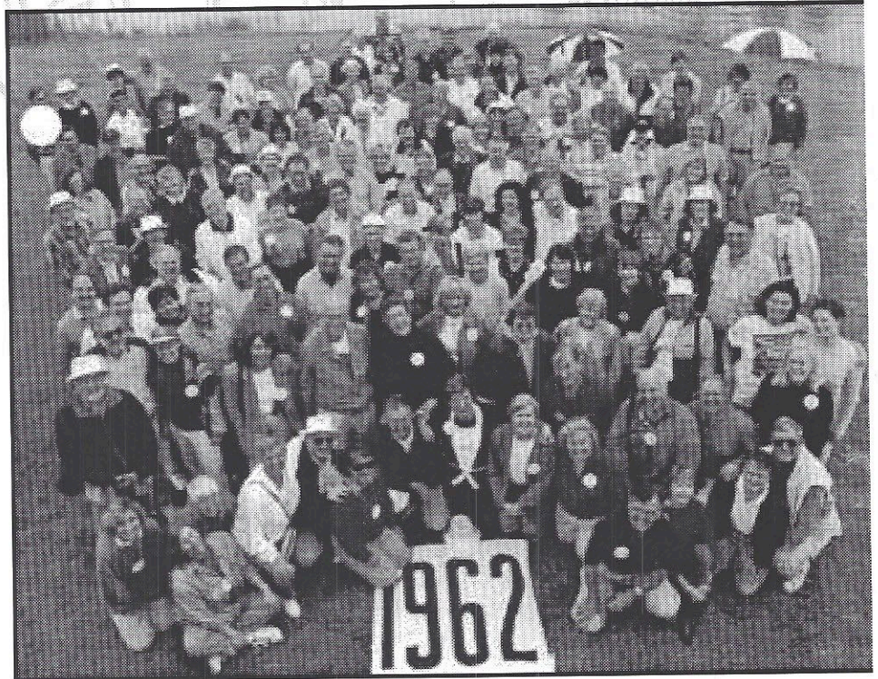
The class of '62 at its 25th reunion.

Remember when? When in an instant the year was 1962? When you couldn't believe that you were taking your last pre-lim? Your last final? Staying up all night to finish your last architectural project? Staying up all night to finish anything? (Speaking of sex....) Had four years on the hill really gone by? Was ROTC really