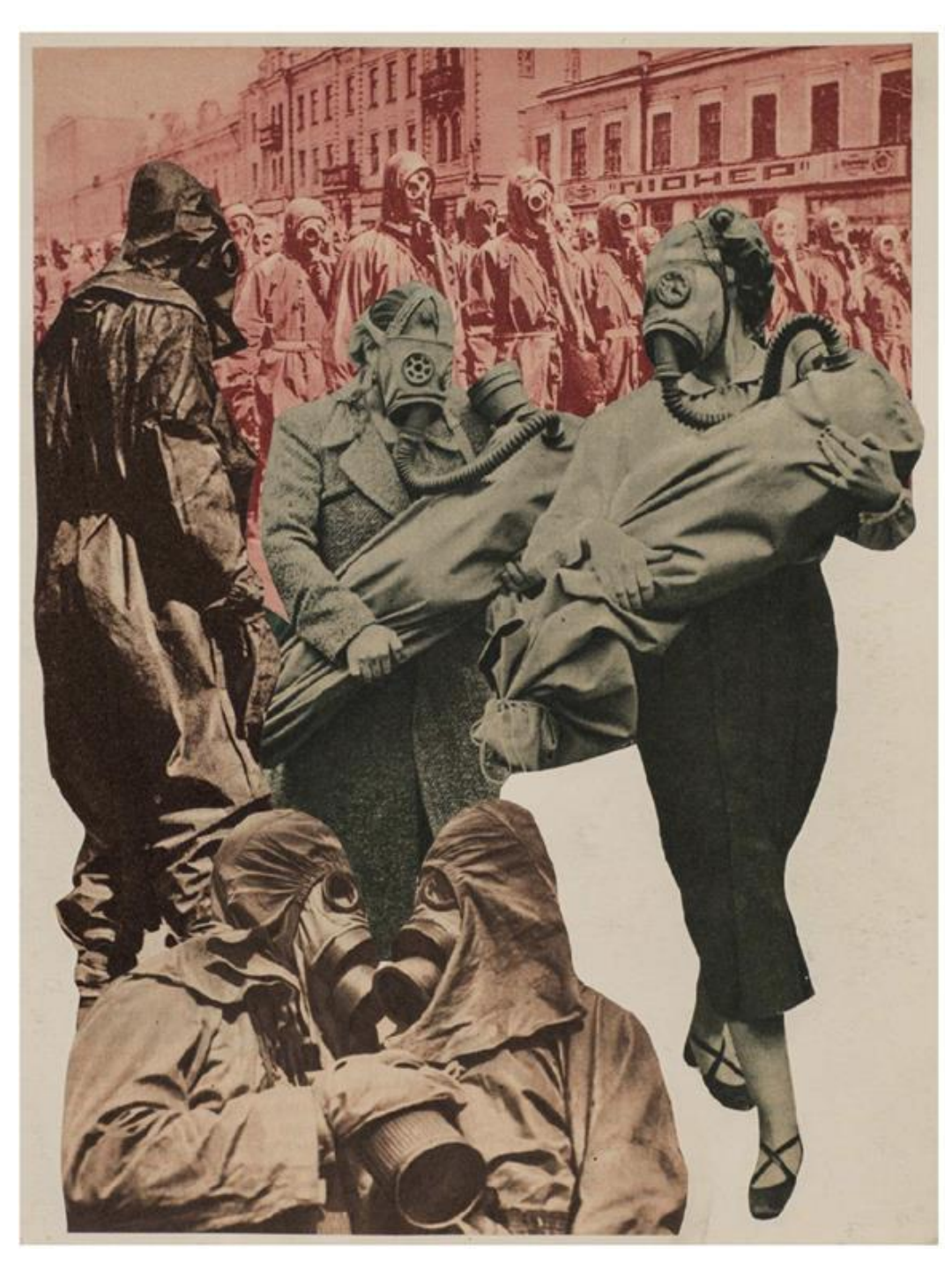
Foto Ada (Elemérné Marsovsky/Ada Ackerman). "Untitled." c. early 1930s-1940s. Unique vintage halftone collage.